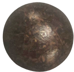
NL-04 Aged Antique 7/8" brown and black flecks with a worn, aged look