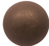
NL-05 Natural 7/8" matte, greenish brown finish