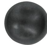
NL-10 Black Pearl 7/8" a blue-black finish