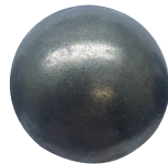
NL-09 Antique Nickel 7/8" an antiqued silver finish